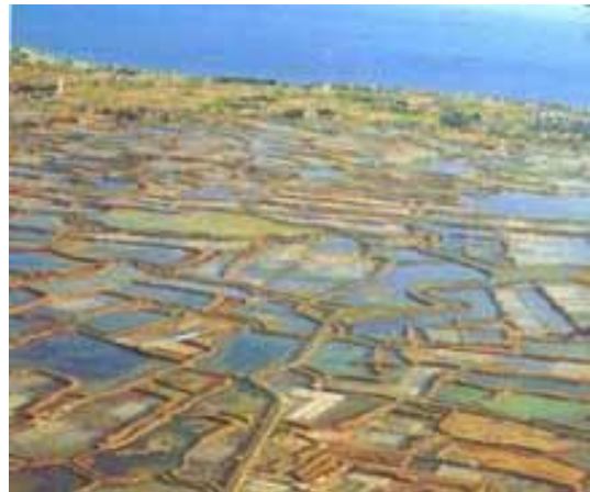
French salt drying ponds

This is why natural unrefined sea salt is so great! It comes in "precise dosages" that are perfectly matched to the mineral composition of your body. The minerals are in an organic form that is completely processable by your body, and you cannot take an excess dosage since all salt in excess of your needs is naturally expelled from your body.