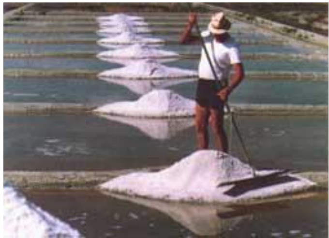
Celtic Sea Salt being harvested in France

Are You Salt Starved? Many of us definitely use too much salt in our diet. We crave it. This is because our bodies crave the 82 missing mineral and trace elements that are absent from our table salt. Then our bodies send the message to us to consume salt. But the salt we consume doesn't have these 82 elements, so our bodies send the message out again "eat more salt!" Thus a destructive cycle is set up which leads us to eat too much sodium chloride, which due to its processing cannot be properly processed by our bodies