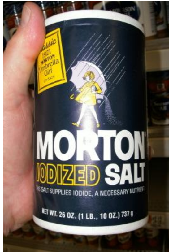
The stuff to Avoid

I recently went to my local Wal Mart and Safeway grocery stores. I chose them because there is usually a Wal Mart or Safeway store near just about everyone. The following pictures and descriptions were from my visit. These are October 2008 prices.