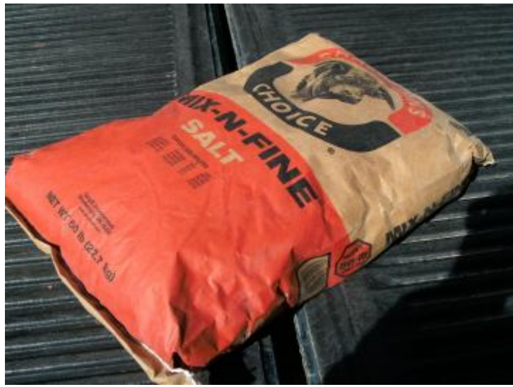
Agricultural Mixing Salt, fine grain

I remember that salt is only made by God. And the salt I buy is nice and pure, completely white. So it is not dirty or contaminated by dirt.