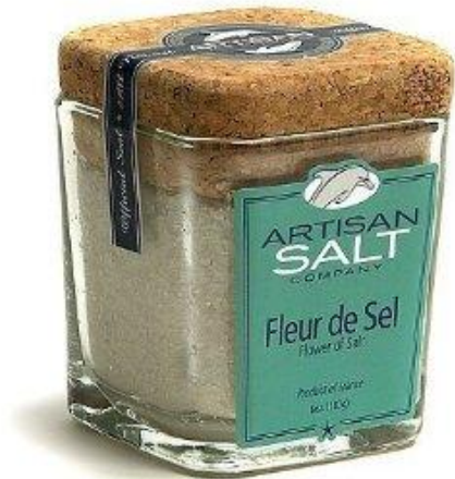
Gourmet Organic Salt

The Fleur de Sel brand shown here is a favorite of many gourmet cooks. You will discover that organic salt tastes different. It is milder and less bitter than refined (processed) sea salt. The taste difference, once you discover it, is amazing. Many gourmet cooks will only cook with organic sea salt.