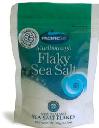
From New Zealand