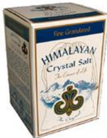
From the Himalayas