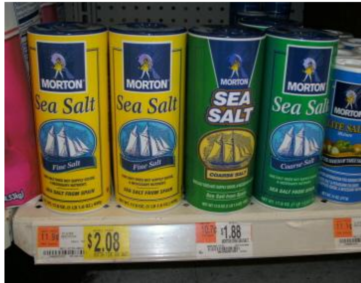
Morton Gourmet unprocessed salts

This salt will serve the gourmet cook well, but not the health-conscious organic salt consumer.