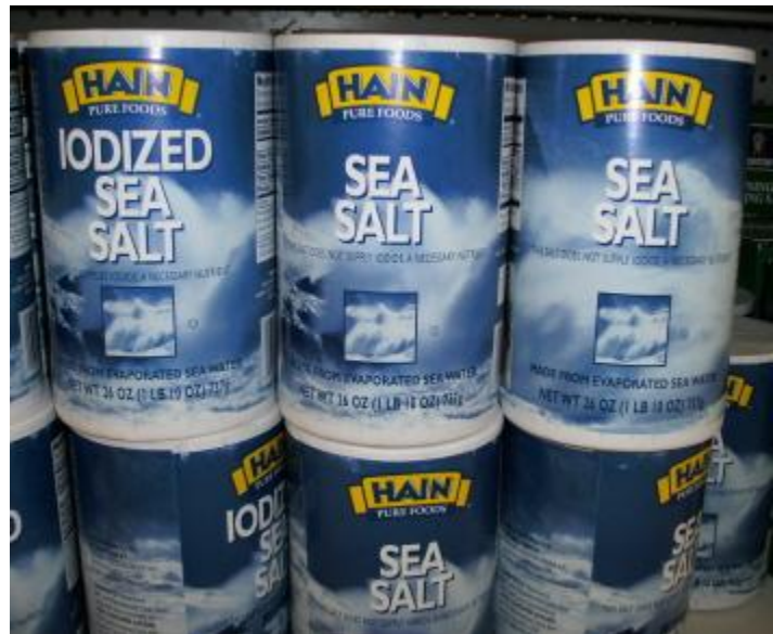
Hains in both iodized and non-iodized

Bt the way, non-processed salt, such as this, already had organic iodine in it. Why add more iodine? Probably to please consumers who are brain-washed that salt must contain iodine.