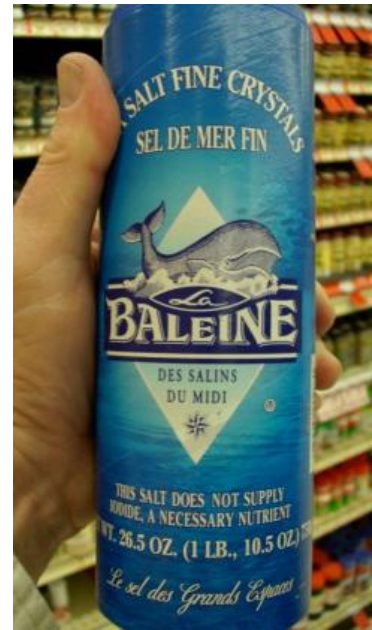
French Gourmet Salt

Alas, it also has an anti-caking agent. Thus it is not organic. It may be safe to eat, quite frankly I just don't know. If I couldn't find any other salt, I would probably buy the Baleine salt for my salt shaker. But, it is not organic.